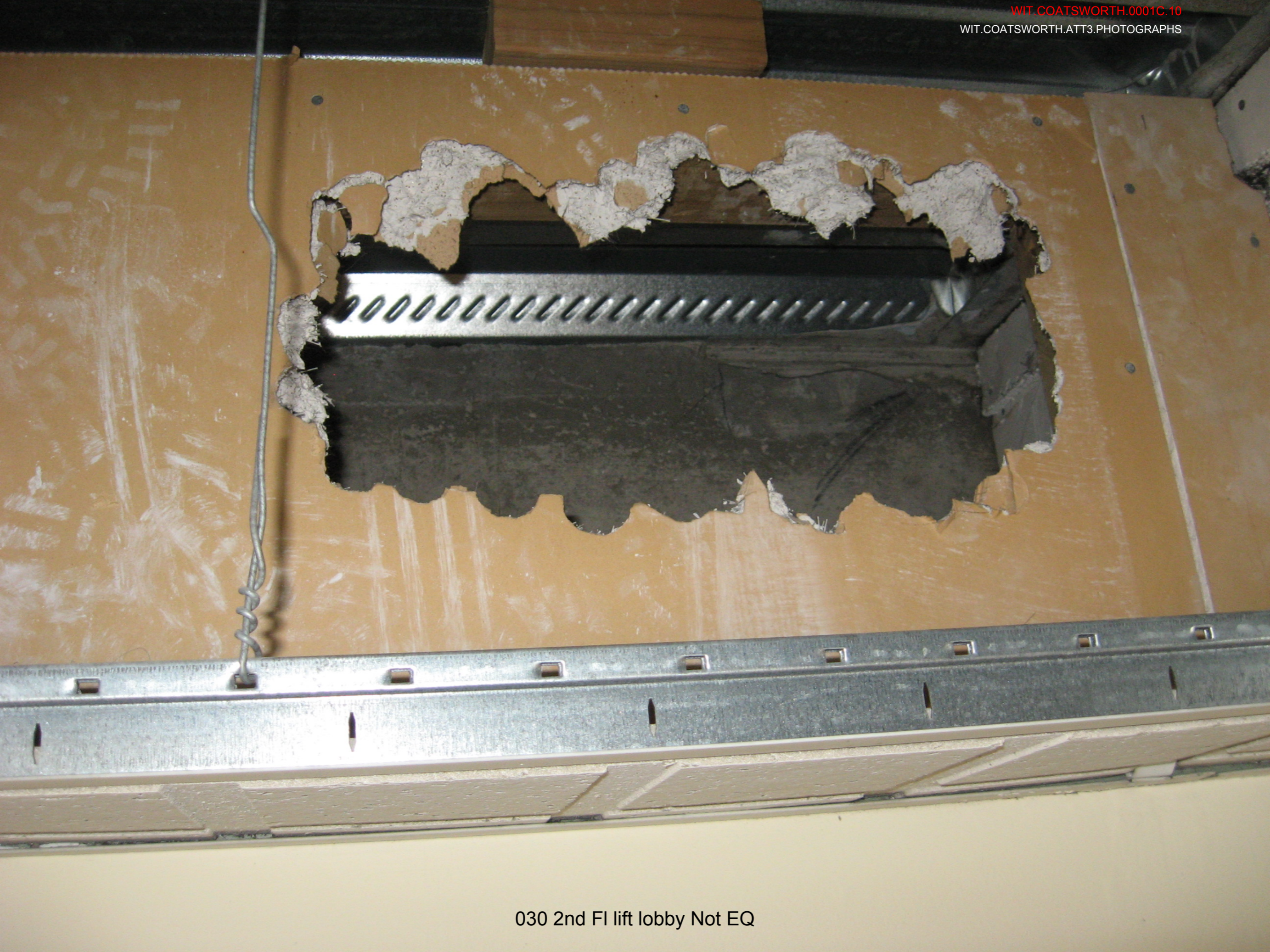
030 2nd Fl lift lobby Not EQ