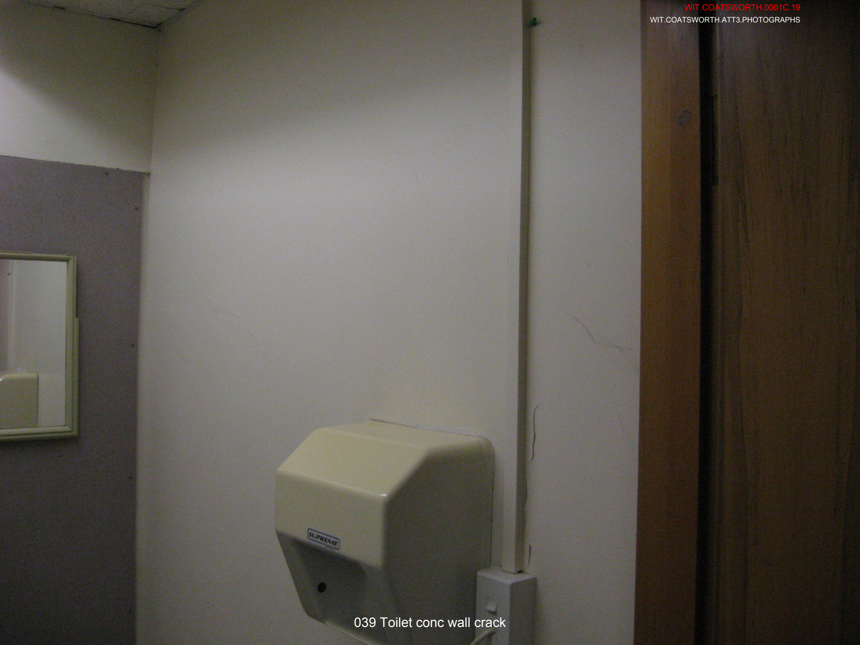
039 Toilet conc wall crack