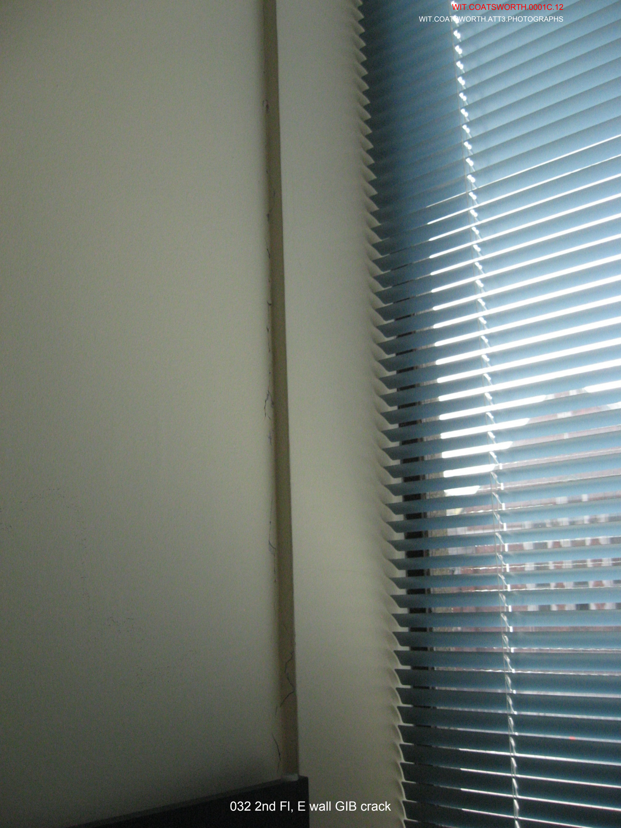
032 2nd Fl, E wall GIB crack