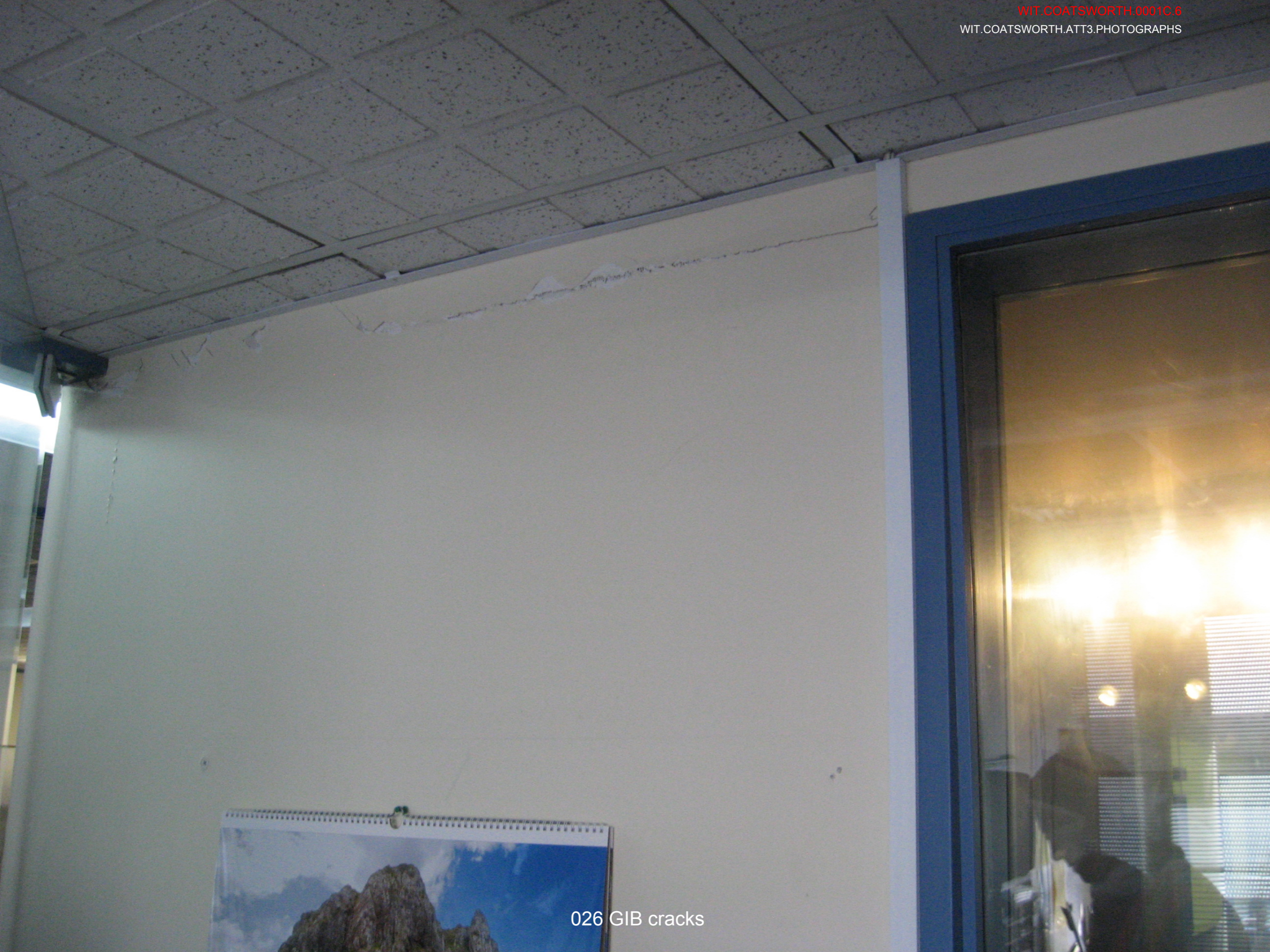
026 GIB cracks