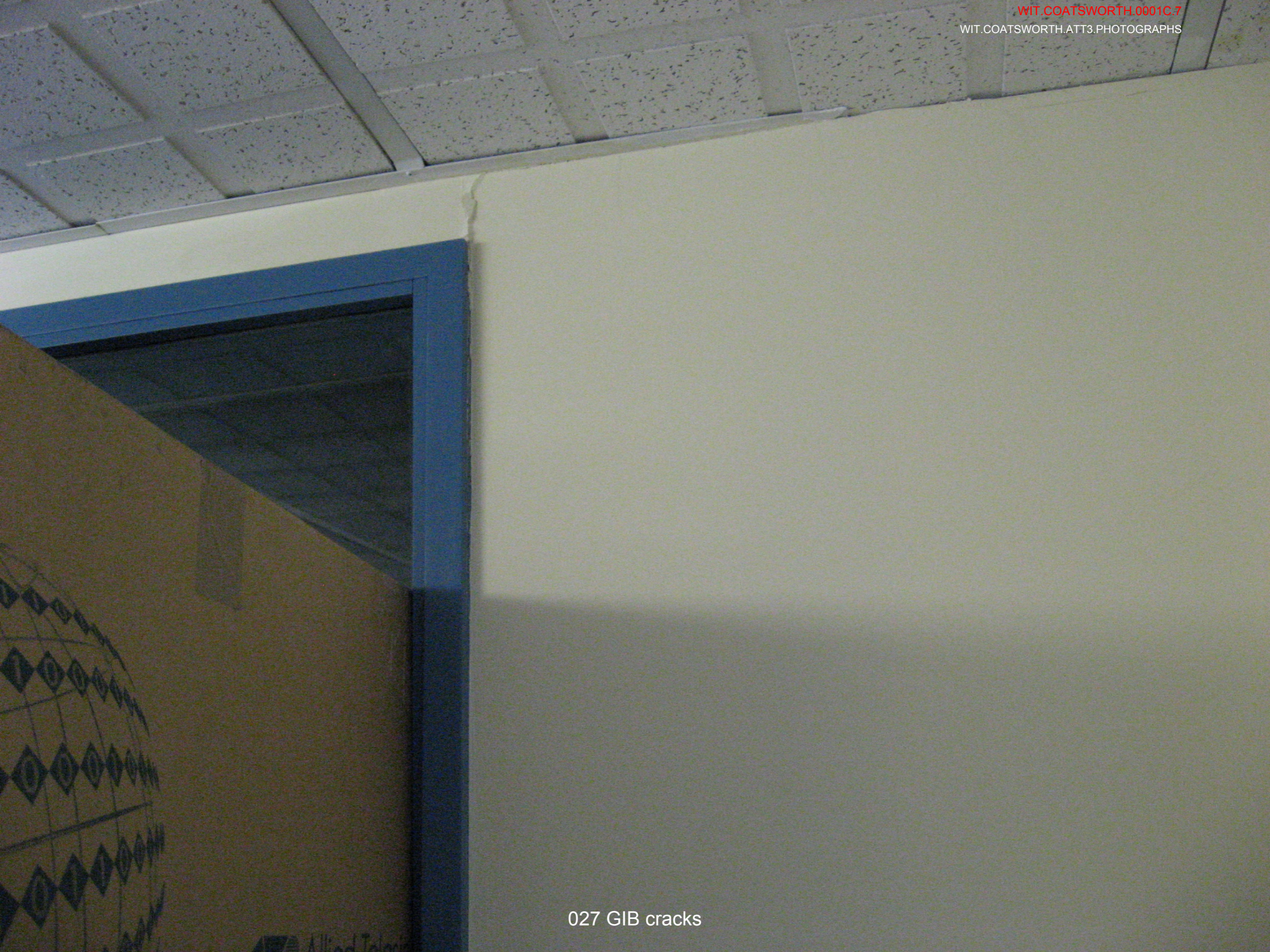
027 GIB cracks