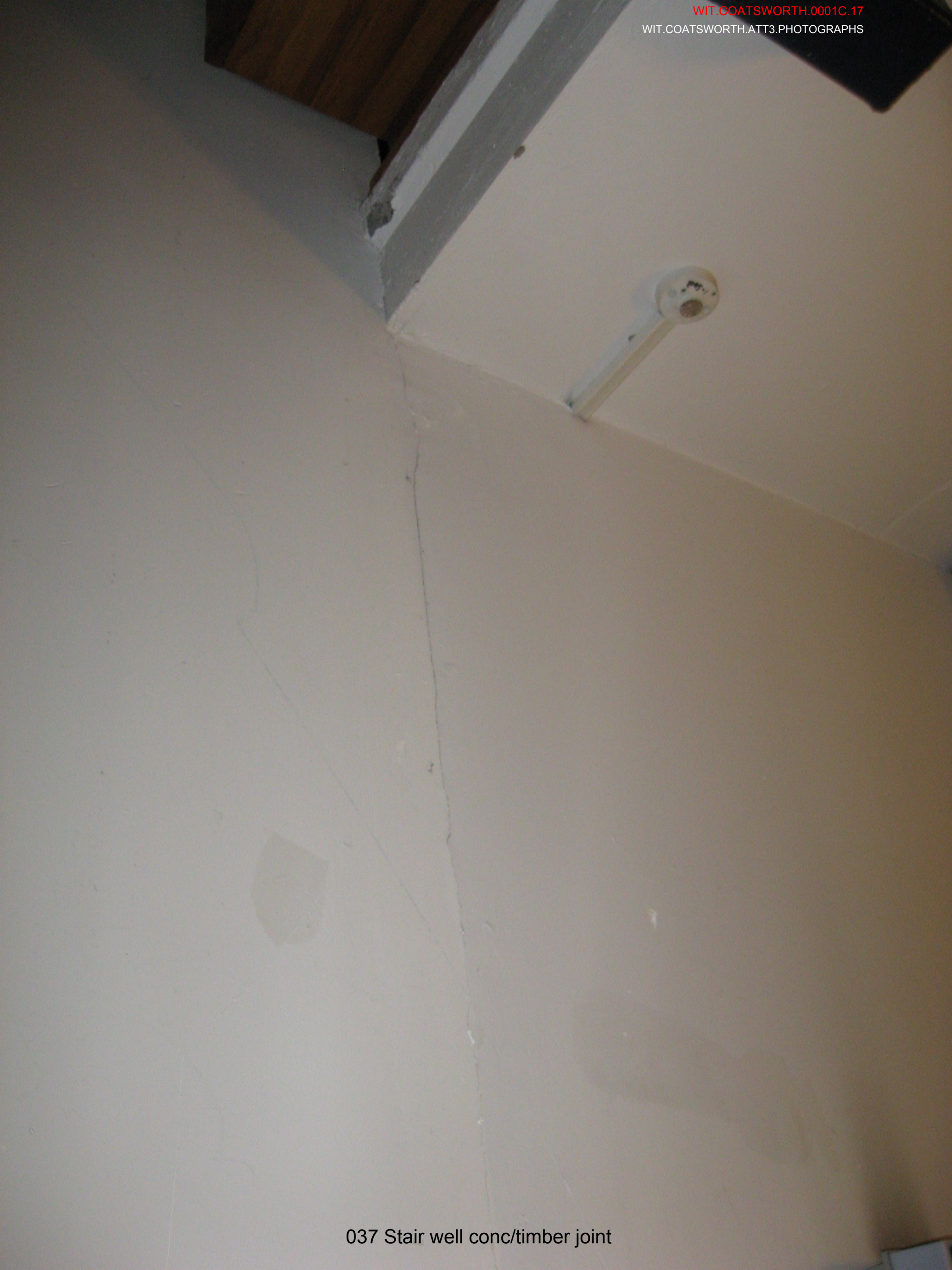
037 Stair well conc/timber joint