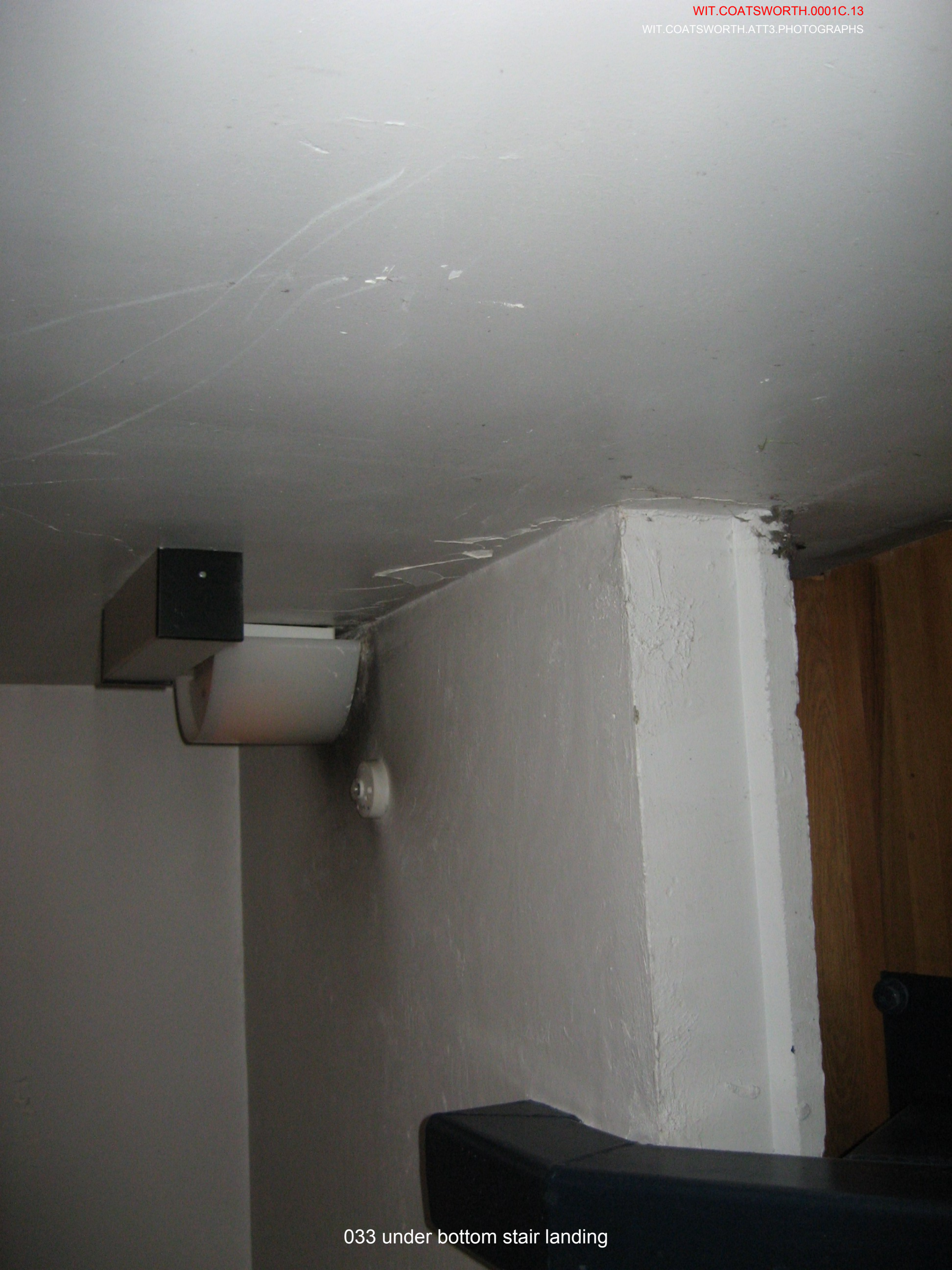
033 under bottom stair landing