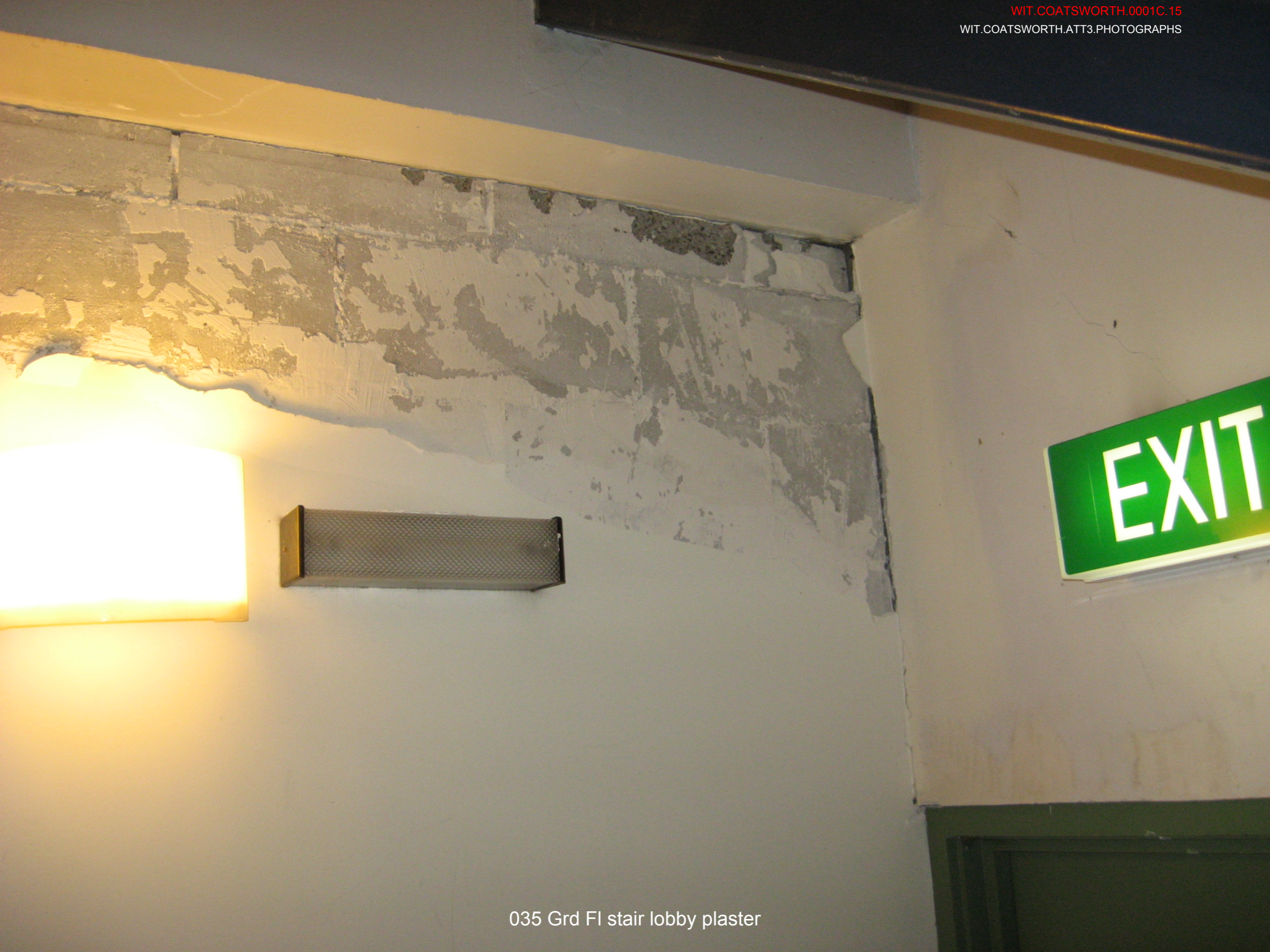
035 Grd Fl stair lobby plaster