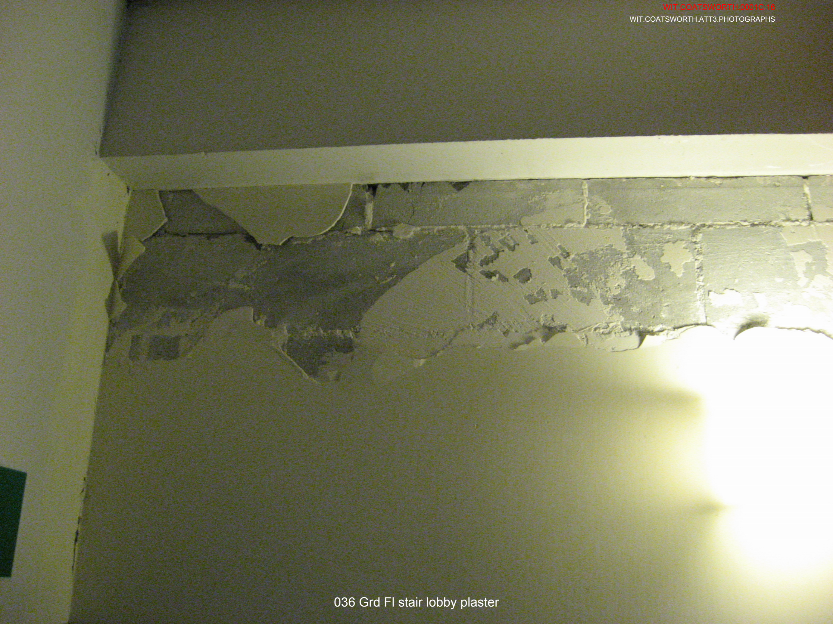
036 Grd Fl stair lobby plaster