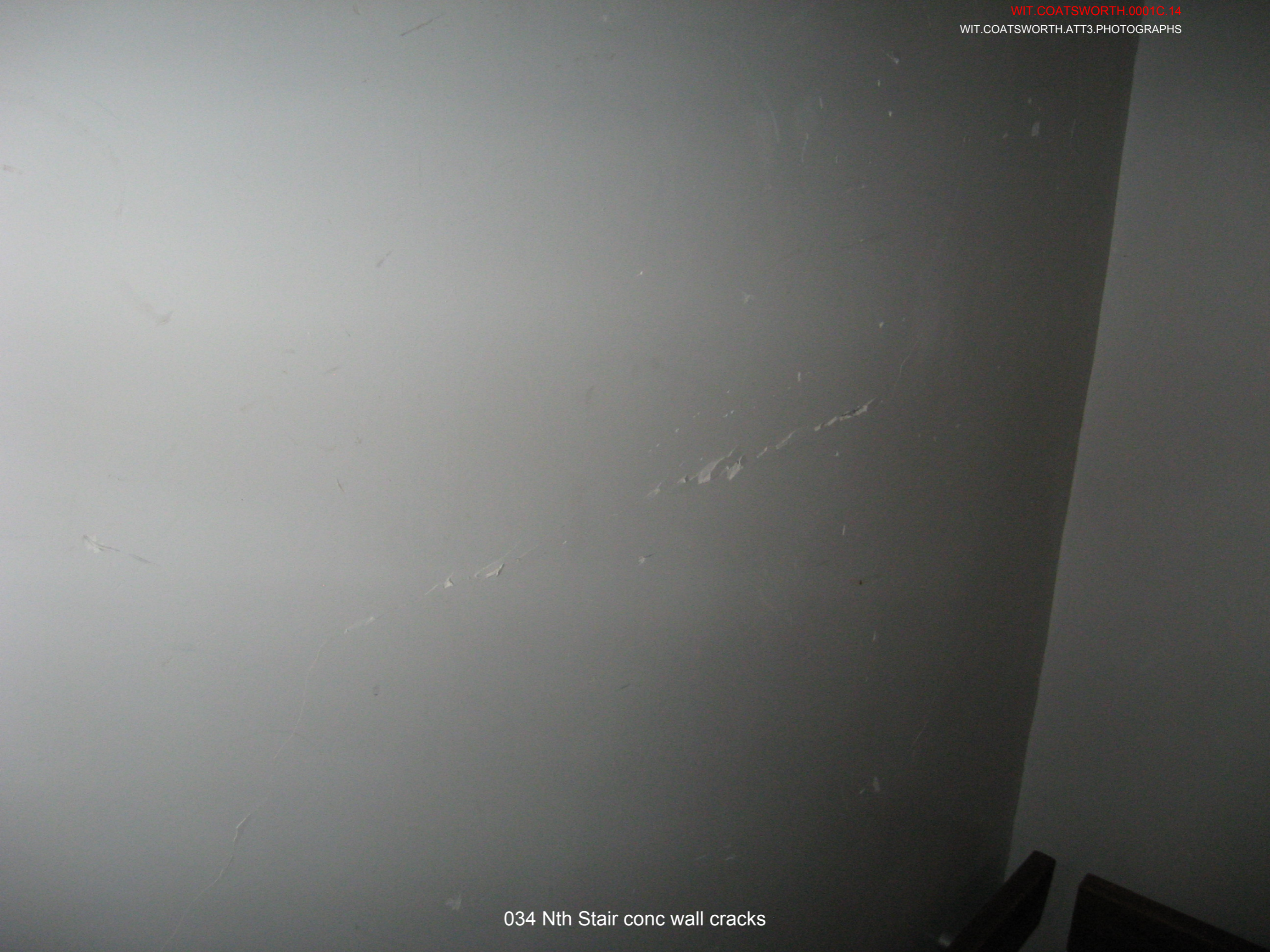
034 Nth Stair conc wall cracks