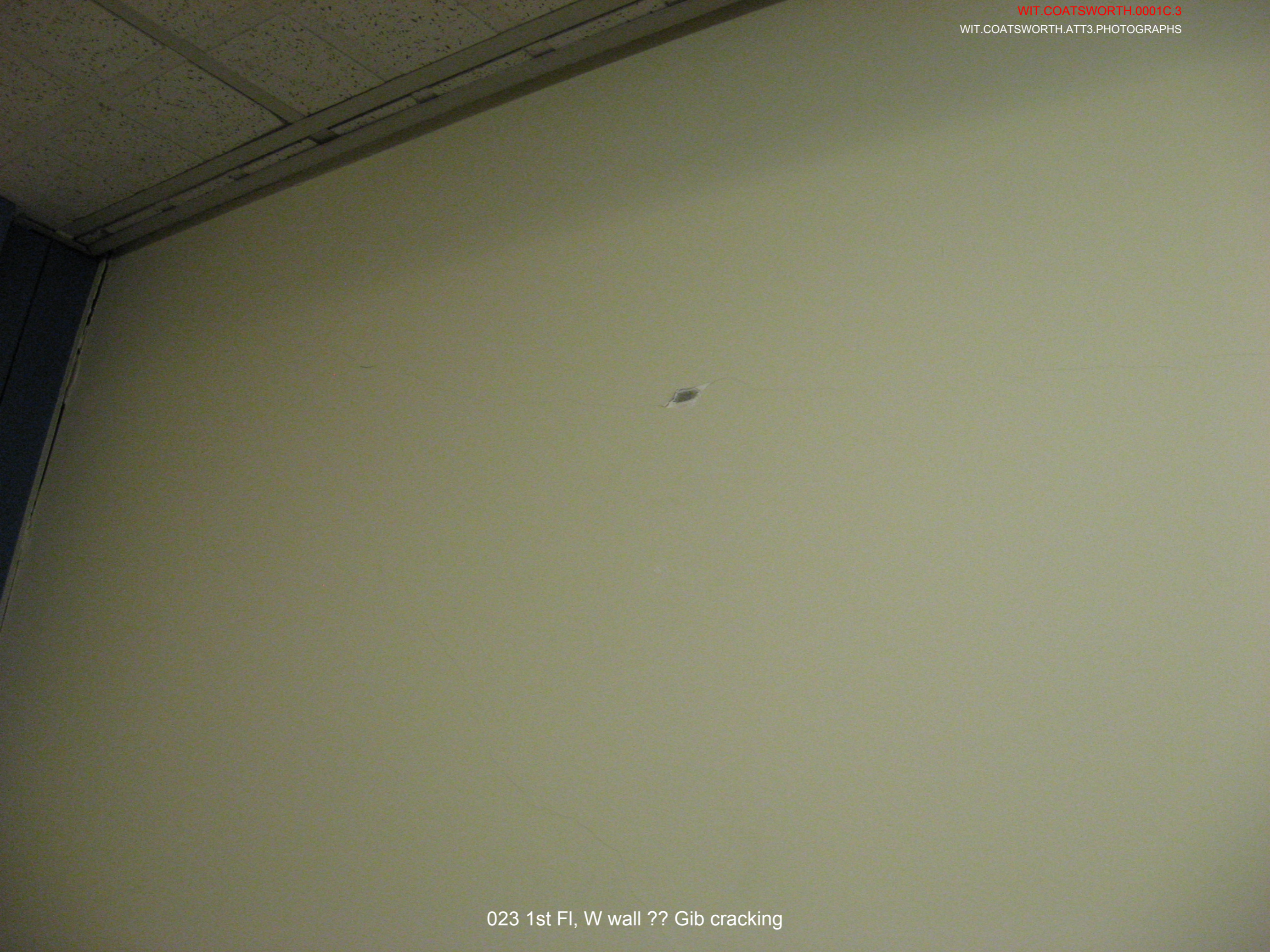
023 1st Fl, W wall ?? Gib cracking