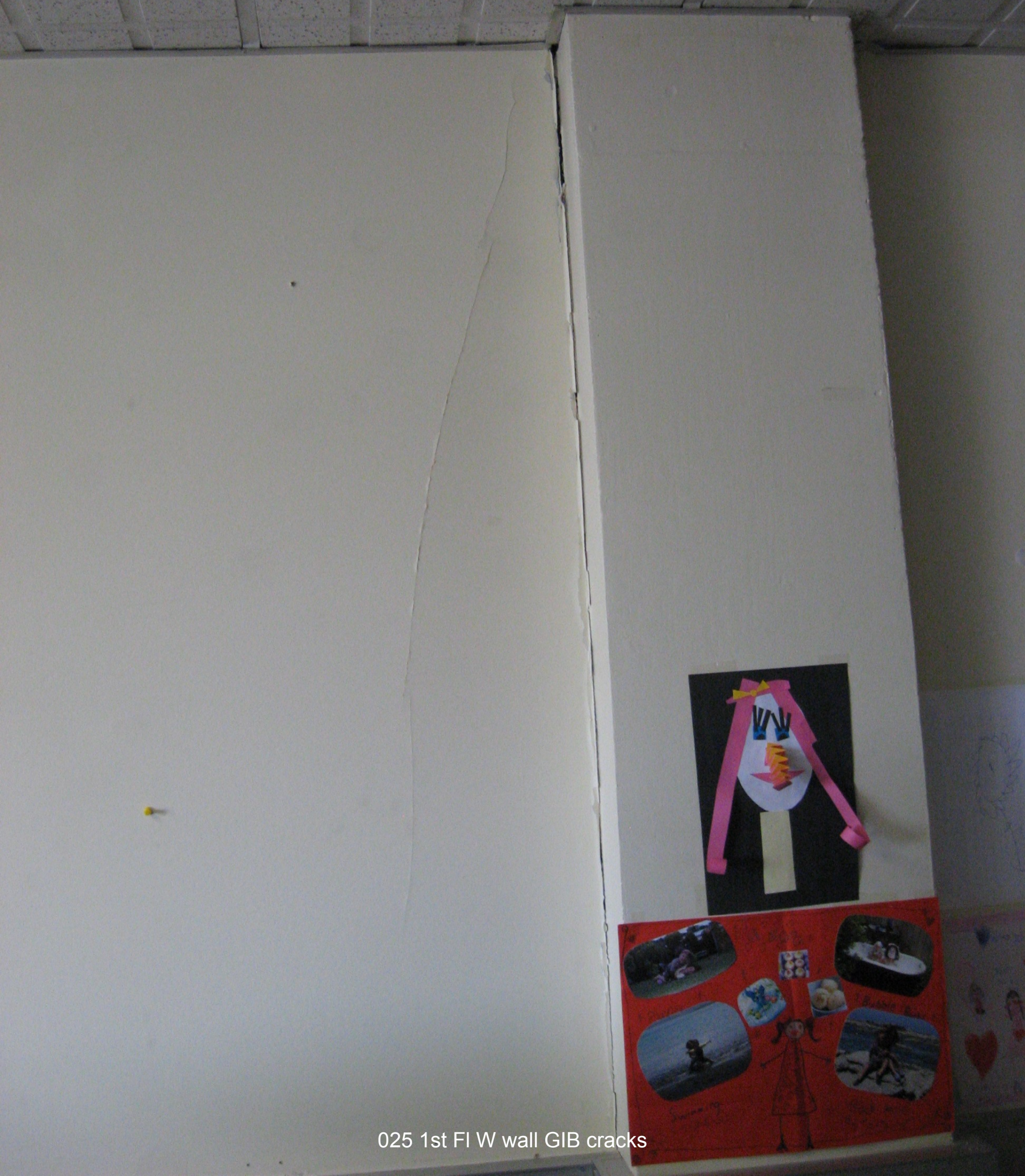
025 1st Fl W wall GIB cracks