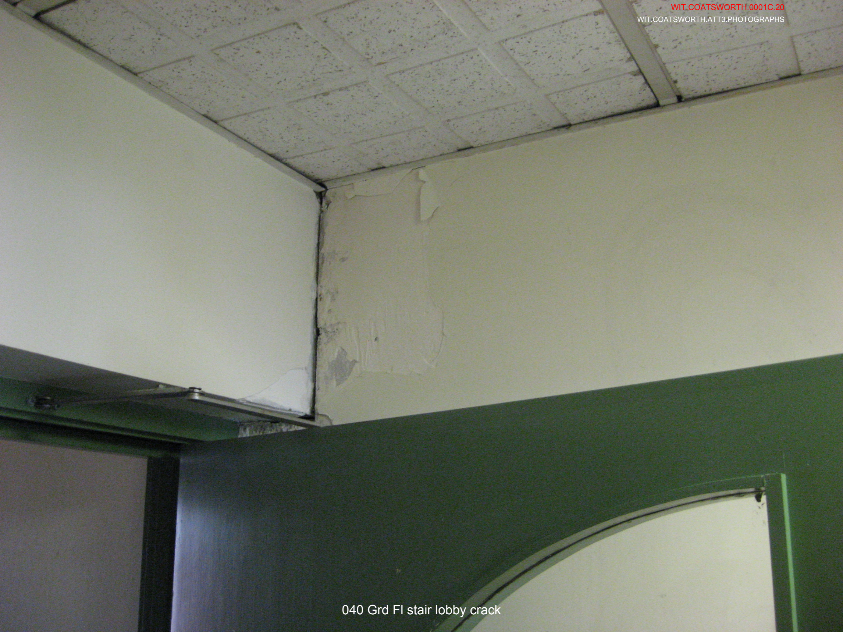
040 Grd Fl stair lobby crack