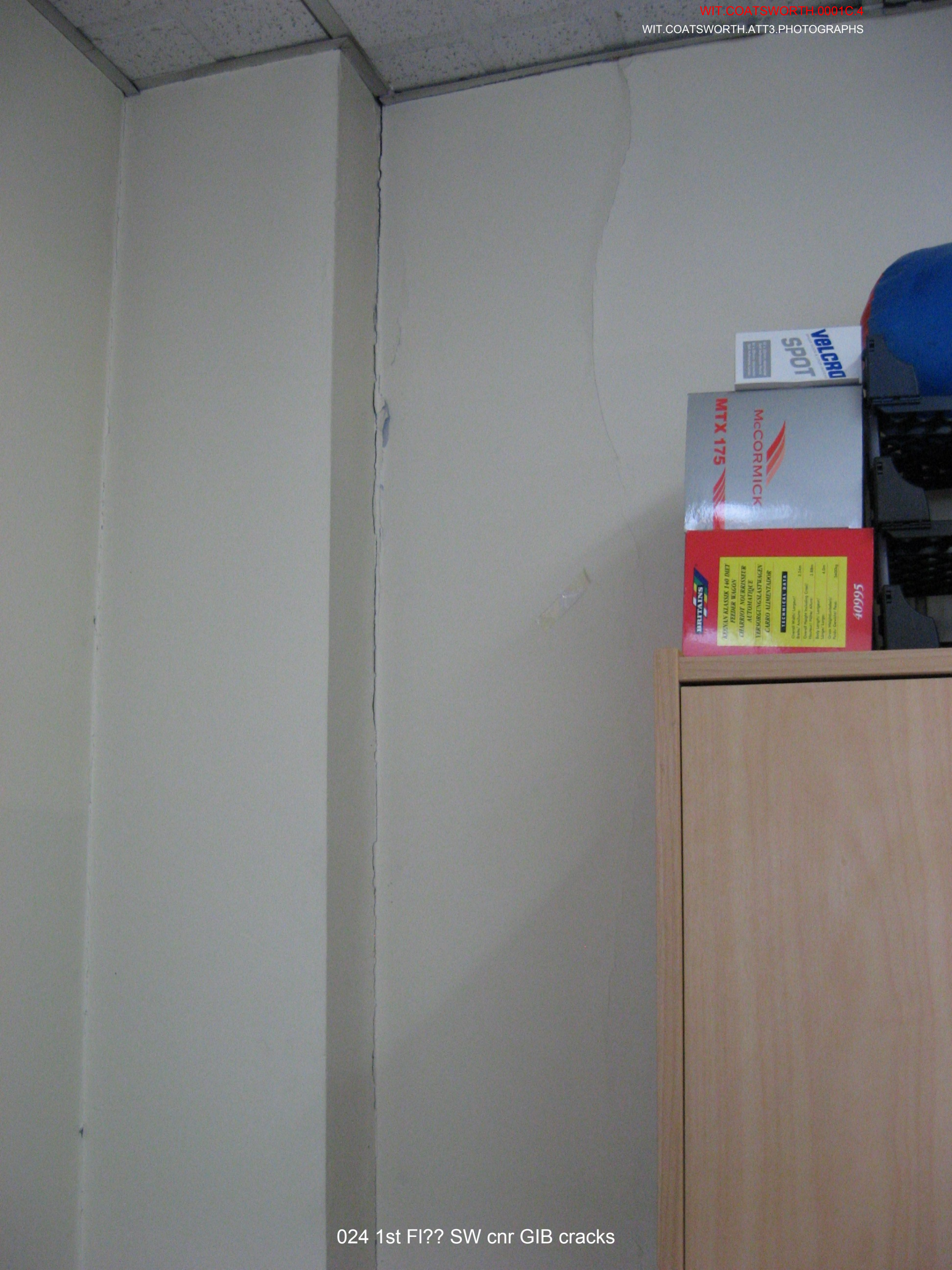
024 1st Fl?? SW cnr GIB cracks