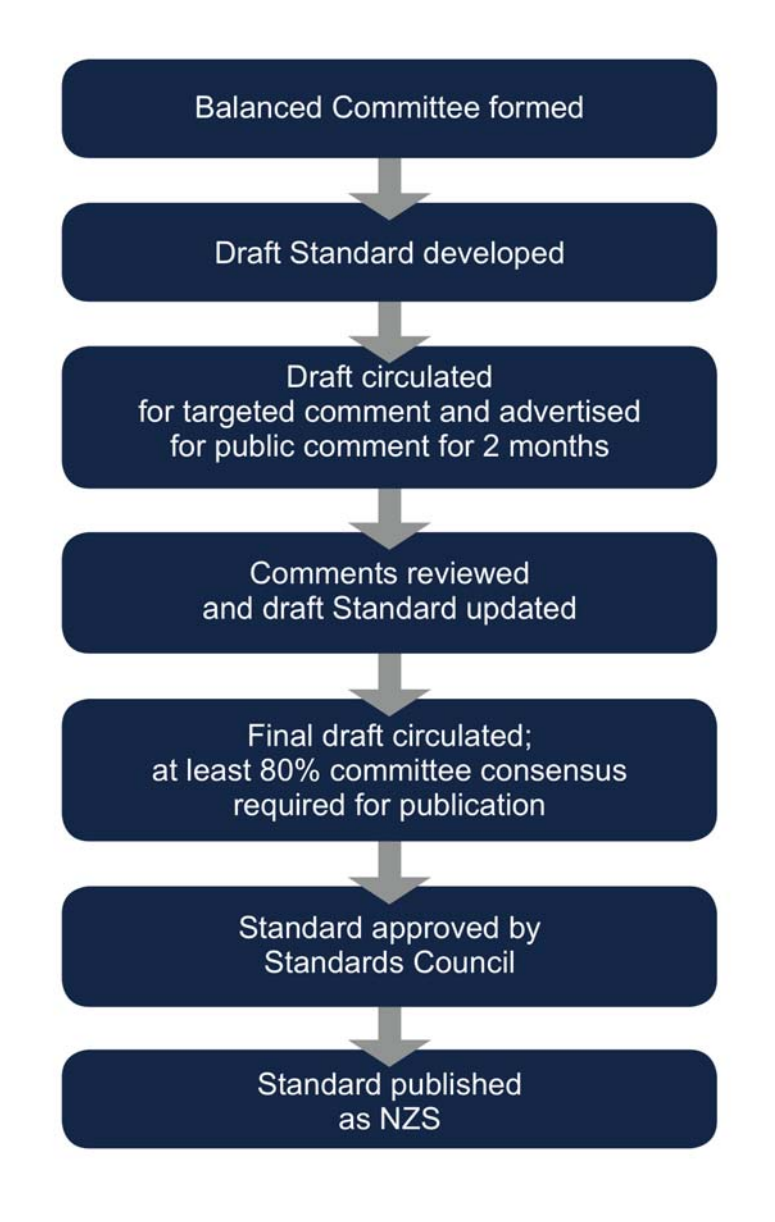
Figure 1 – Standards development process

New Zealand Standards are agreed on a 'consensus basis'.