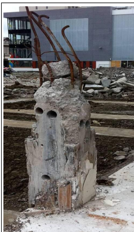
Figure 1: Level One Column 18 at Line 4 D/E

To supplement the core testing, 'Schmidt Hammer' readings were taken on a further 19 column remnants from Burwood Landfill. The Schmidt Hammer is a non-destructive test method using a spring loaded 'Hammer' which impacts on an outside surface of the concrete.