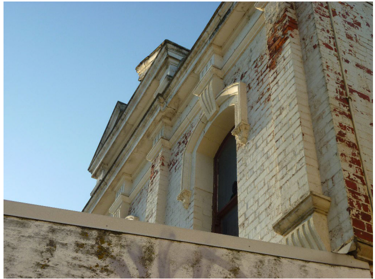
Condition of facade.JPG