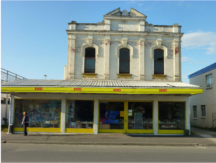
5 to 7 Riccarton Road.JPG