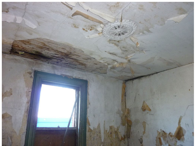
General condition of building.JPG