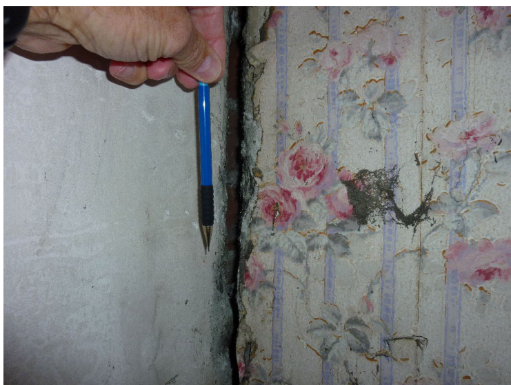
Crack in facade wall.JPG