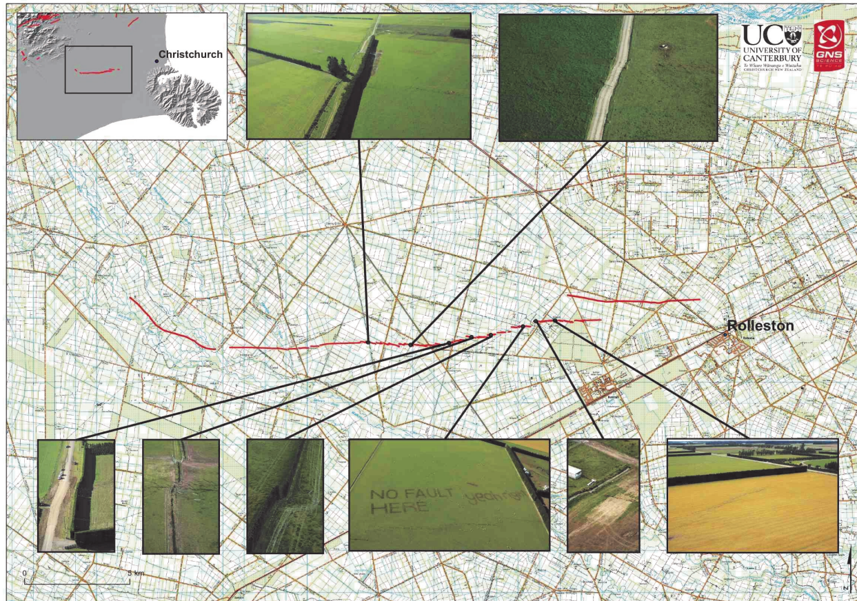
Figure 1 : Fault map of the Darfield earthquake.

In 1940 the El Centro earthquake in California was recorded by an accelerometer. These data provided much-needed information about the shaking that earthquakes cause and revealed that ground shaking could be much greater than assumed by simple loading analysis. This information, the deployment of accelerometers in New Zealand, and better mapping of active seismic faults was used by Dr Ivan Skinner and others to update the seismic loading code published in 1965. This new code introduced the idea of different risk zones, with Wellington in the highest, Christchurch in the medium risk zone, and Auckland in the lowest risk zone. The zones implied nothing about the probability of earthquakes, but did describe the expected degree of shaking for each area.